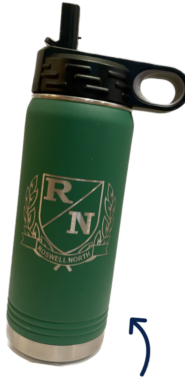
PTA Bronze, Silver and Gold Members get this RNE 20 oz. Stainless Water Bottle!